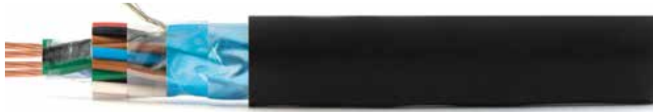
TABLE 5 Instrumentation cables Unarmoured Type - 1 Cu /PVC /Osc /PVC