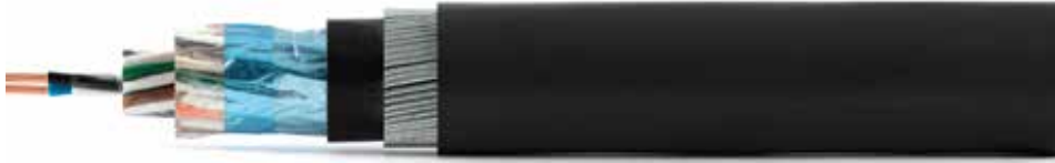
TABLE 6 Instrumentation cables - Armoured Type 2