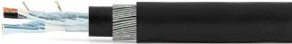
TABLE 9 Instrumentation Cable - IOSCR Armoured