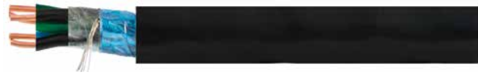
TABLE 1 Instrumentation Cable - Unarmoured Type - 1 Cu / PE / Osc / PVC