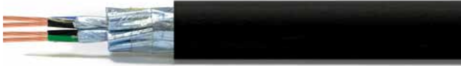
TABLE 7 Instrumentation cables - Unarmoured Type 1 Cu /PVC /Isc /Osc /PVC