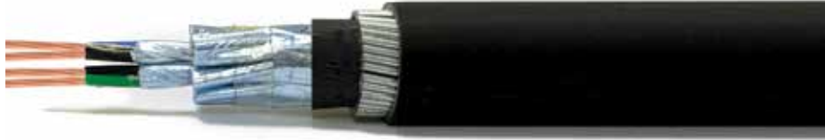
TABLE 8 Instrumentation cables - Armoured Type 2 Cu /PVC /Isc /Osc /SWA /PVC