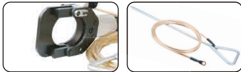
Hydraulic cutting head PC-105 Grounding device