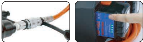
Quick coupler 14.4V Li-ion battery