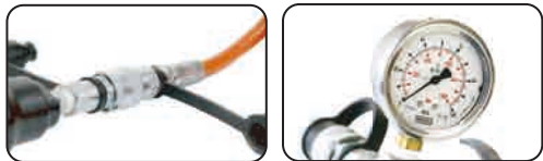
Quick coupler Pressure gauge